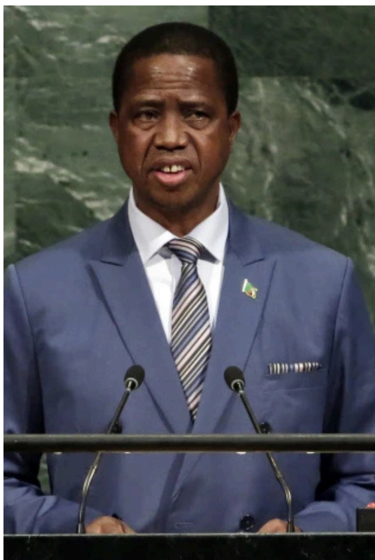
OQBP MOURNS THE PASSING OF FORMER PRESIDENT EDGAR LUNGU