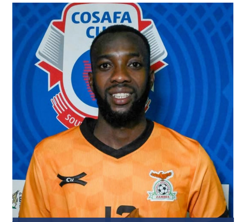
LATE JUSTIN SHONGA TOPS ZAMBIA'S COSAFA SCORING CHARTS WITH SIX GOALS